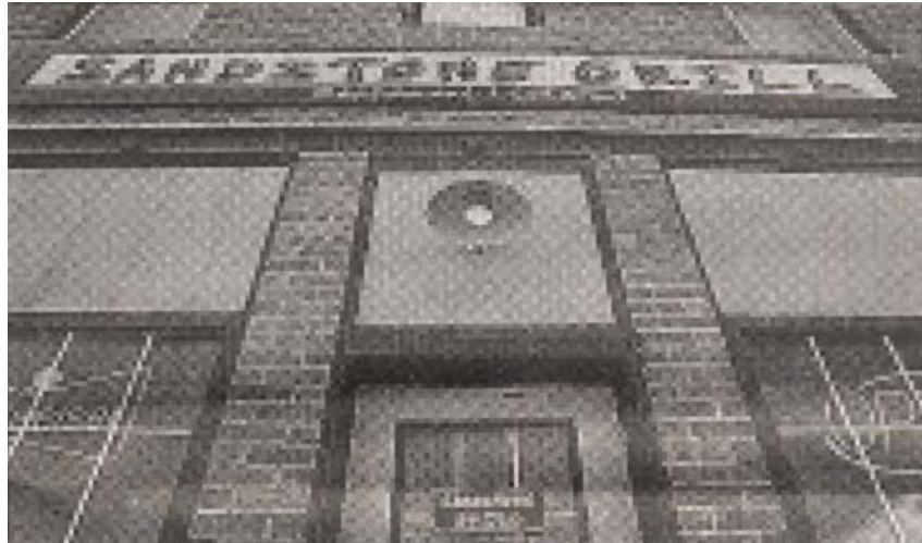
The Sandstone Grill is located at 416 Grand Ave in downtown Burwell. The building built in 1908, served as the café for the Historic Burwell Hotel before being transformed into the new restaurant.

"The quality and the variety of food is one thing that makes them stand out," she said.